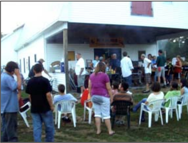
This is our 15 year celebration and our 7th annual "End of Summer Bash" that took place on Friday August 24th with over a 100 people.