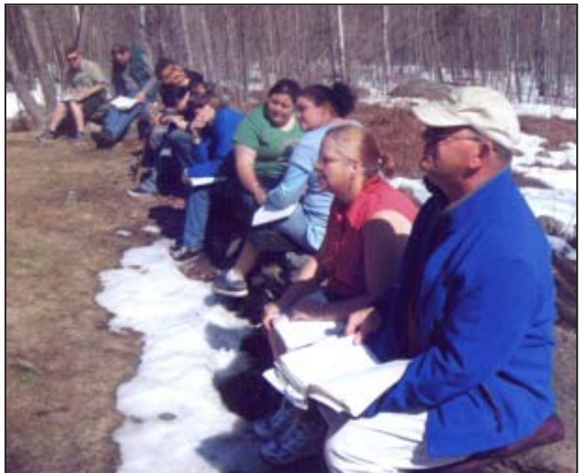
Staff and youth listening to Art at the “Seek Ye First Weekend”

You can hike on a mountain, you can ski on a mountain, pick berries on a mountain... Tumble down a mountain ...but, can you pray and fast on the mountain? You Betcha! That’s just what 14 teens and 7 staff members did on the weekend of April 19 and 20th. The mountain was located in Weld, Maine. The camp we stayed in was appropriately