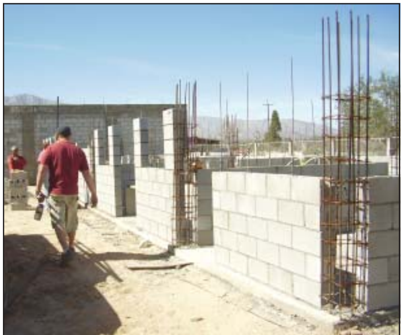
We are helping raise funds for the Son Shine Hacienda Orphanage with the "Build a Future Buy A Block" Campaign. Above, picture of the orphanage as we left Sat. Feb. 24th.