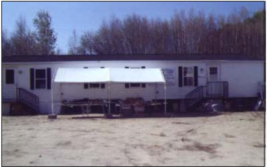
Alpha & Omega Thrift Shop at NPSW location on Brown St. Norway.

The Alpha & Omega Thrift Shop is located (inside the Norway/Paris Solid Waste facility) on 39 Brown Street in Norway, Maine. Take the road (across from Amato’s and on the corner of the Oxford Networks building and Cafe Corner). Go down Brown Street about 1/4 mile and drive through the NPSW facility and you will see us just down over the hill on the right on your way out of the plant. This is just a little over 2 1/2 miles from the teen center that is located on 254 Webber Brook Road in Oxford. If you need help call Bert at 515-3000.