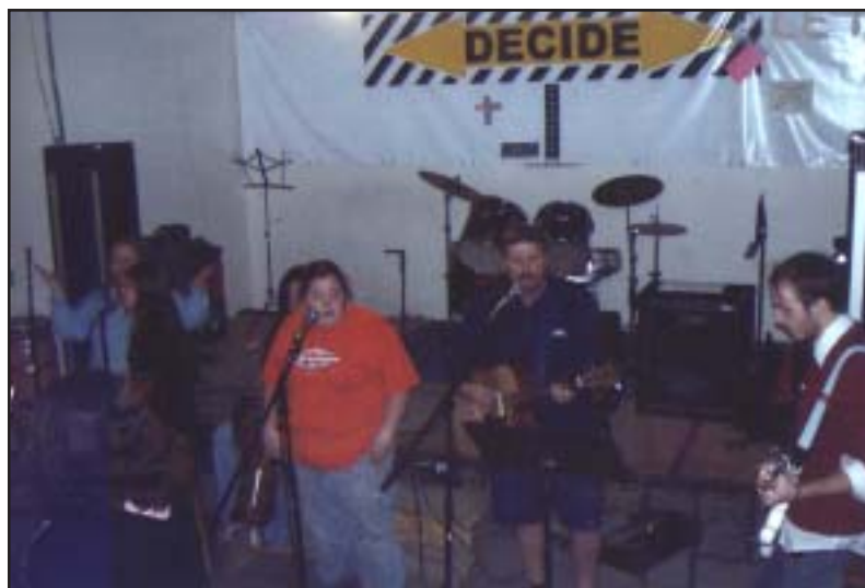
Saturday Night Out Post worship team.

The Outpost Saturday Night Service 6:00-9:00 PM takes place the first Saturday of the month to give an opportunity for the people that can't stay for the Friday night service. We meet every Friday except the last Friday, because of our Saturday Night Outpost. These Outpost meetings are growing, and staff and youth alike look forward to the time we spend learning about God and worshipping him in all we do.