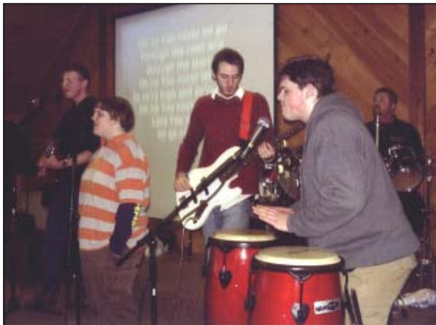
This is one of our Praise and Worship Teams at Winter Weekend.