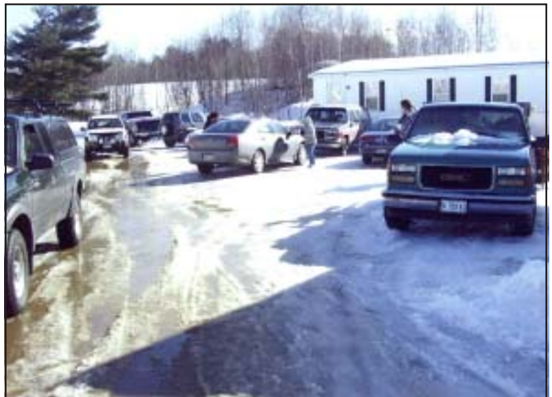
Grand Re-Opening Celebration at Alpha & Omega Thrift Shop, our 24' x 60' mobile unit in background. A great success.

First yard sale for the season April 23-29th, on Rt. 26 by the Fish Market