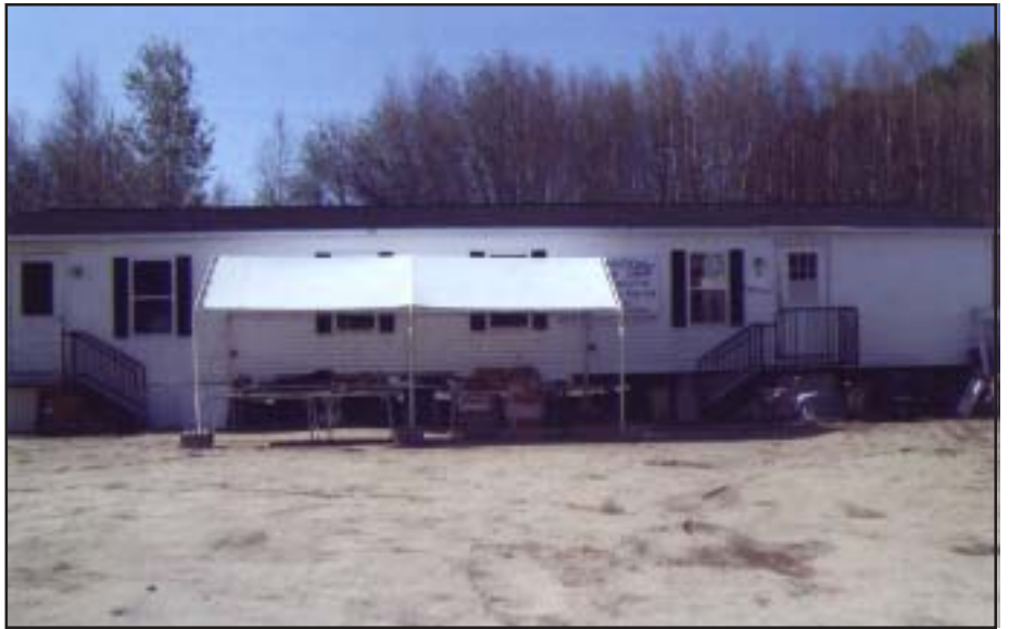
Our new 24' x 60' Double Wide. Alpha & Omega Thrift Shop at NPSW location on Brown St. Norway.

“Where Junk becomes Treasure”! We are well into our second year of operation and sincerely thank everyone that helped us. On May 1st of last year we opened in a meager 16' x 24' building and quickly outgrew it in a month. Fast forward to now, we now have a 24' x 60' double wide mobile unit, that came from Schiavi Leasing, (formerly used as portable classrooms around the state). We also put in electricity for heat, lights, and to allow us to make sure things worked as they are dropped off. We held our own through out the winter months and believe this helped spread the word we are here. We now have approximately 1440 square feet of floor space to shop in and have had a great response from the Oxford Hills and surrounding area to both donate and to shop and save, at the Alpha & Omega Thrift Shop. In this tough economy we believe the need will increase even more. We get some real nice items that people can get many more years of use from that would have been discarded into the trash. We estimate we are taking over 3-5 tons out of the system a month that would have been in land fills.