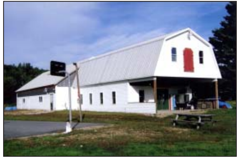
Phase I a 26' x 52" two story Gambrel building with Game Room. Opened on March 16, 2001.